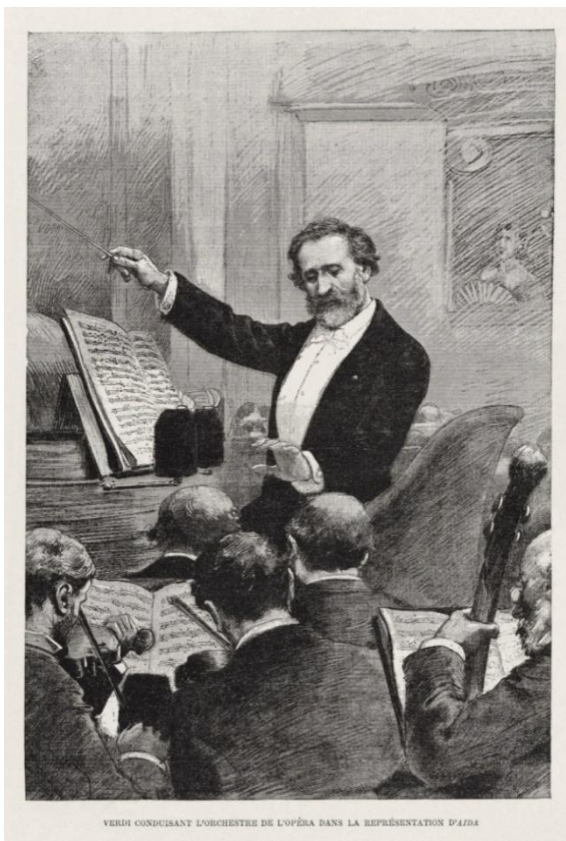
Verdi conducting his opera Aida & Poster of La Traviata's 1853 Premiere at Teatro La Fenice