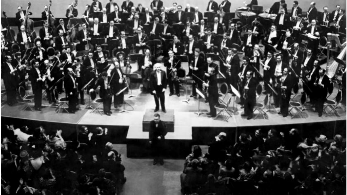
Toscanini Conducts the NBCSO 1938 Premiere Performance of Barber's Essay for Orchestra